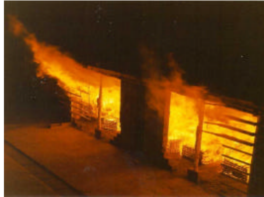
Fig. 7 Natural Fire Safety Concept Test

compartment. A typical test is illustrated in Figure 7. Some of the significant test results are summarized in Table 3.