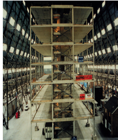
Fig.2 Concrete framed building