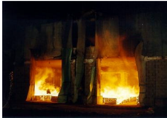
Fig. 5 Concrete building fire test

A large scale fire test was carried out on the ground floor of the seven storey concrete building (Figure 2). The test took place within a compartment measuring 15m by 15m in plan. The purpose of the test was to investigate the response of a modern concrete building to a large-scale natural fire. In particular, the studies concentrated on the influence of restraint from the surrounding cold structure and the impact of spalling on the effectiveness of the load-carrying members. Overall stability was maintained despite significant deformation of the perimeter columns and significant spalling of the underside of the floor slab. The implications from this test are the subject of a current research project. Figure 5 shows the fire being conducted on the concrete building.