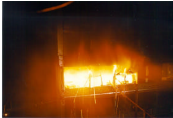
Fig. 4 BRE Corner fire test

An extensive collaborative programme of fire tests in various locations within the eight storey steel framed building have been carried out. The research projects were funded by the UK government, the UK steel industry and the European Community. Tests ranged from the use of purpose-built furnaces fixed to individual elements through to large-scale natural fires on realistic sized compartments with realistic levels of imposed load and fire load. One such test, the BRE Corner fire test, is illustrated in Figure 4. The extent and nature of the fire testing undertaken on the steel building together with some key results in terms of maximum temperature and deformation are described in Table 1. At the time of writing a final fire test is scheduled to take place in January 2003. This test will investigate the performance of unprotected connections and unprotected beams in a compartment with plan dimensions of 11m by 7m.