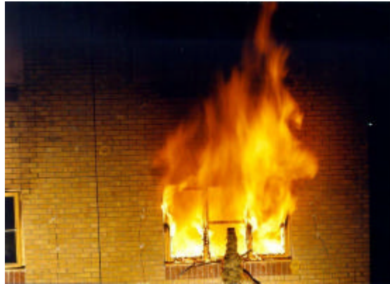
Fig. 6 TF2000 Compartment fire test